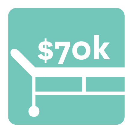
The estimated cost of managing a single full-thickness pressure ulcer is nearly $70,000.<sup>5</sup>